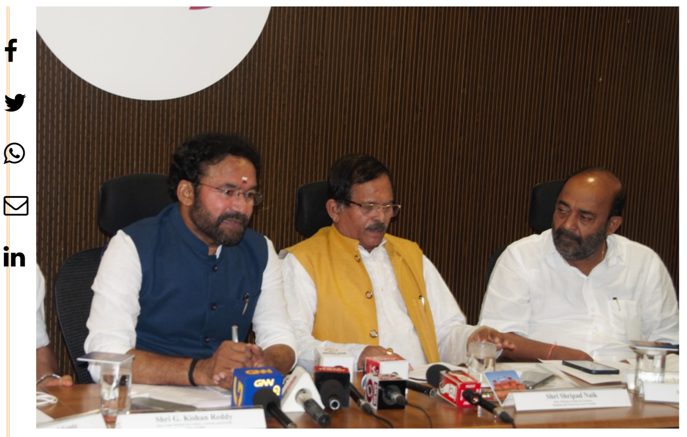
75 Top Destinations in India to be developed on International Standards

Shri Reddy also stated that the major portion of the Ministry's expenditure goes into the development of quality infrastructure relating to tourism at various tourist destinations and circuits spread around the States/UTs. He also mentioned that to commemorate 75 years of India's Independence, top 75 destinations in the country are to be developed on international standards. "All departments have given their comments on the same. The work will begin in full swing to develop the 75 destinations on international standards, once the Cabinet approves it," he added.