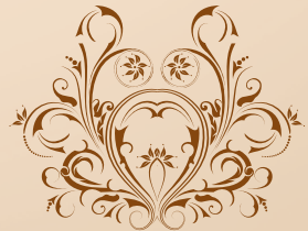
(Subodh Kant Sahai)

I congratulate all the winners of the National Tourism Awards 2009-10 and wish them success in their future endeavours.