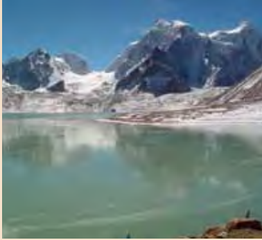
Gurudongmar Lake (North Sikkim)

Situated beneath the majestic guardian deity Mount Khangchendzonga, Sikkim is a land that inspires divine imagination in the hearts of those who visit this beautiful State. A unique land surrounded by visual vistas, rich flora and fauna, environment friendly and warm and hospitable people with rich cultural heritage, Sikkim is indeed a destination for all seasons and all reasons. Covering only 0.2 % of the geographical area of the country, the State harnesses about 26% of the Country's total floral biodiversity. Realizing the need to practice a responsible tourism for sustainability, the State was the first to ban the use of plastic bags in the country and Green mission has been initiated towards ensuring environment friendly tourism in the State. Sikkim is a special destination for pilgrimage, adventure, eco-tourism and village tourism with exclusive home stay facilities offered by the local people. Sikkim is indeed an irresistible destination which is mesmerizing, mystical, peaceful and hospitable.