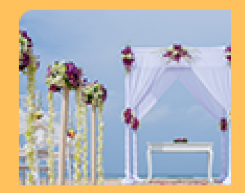
Andaman & Nicobar Islands From beachfront resorts to underwater ceremonies, be assured of an unforgettable wedding experience.