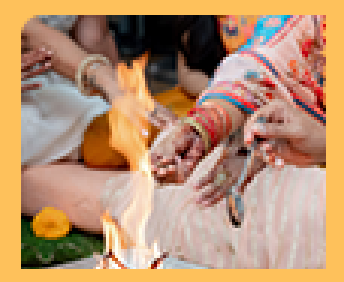
Jaipur The regal allure of India's 'Pink City', offers opulent weddings set in majestic palaces and heritage hotels.