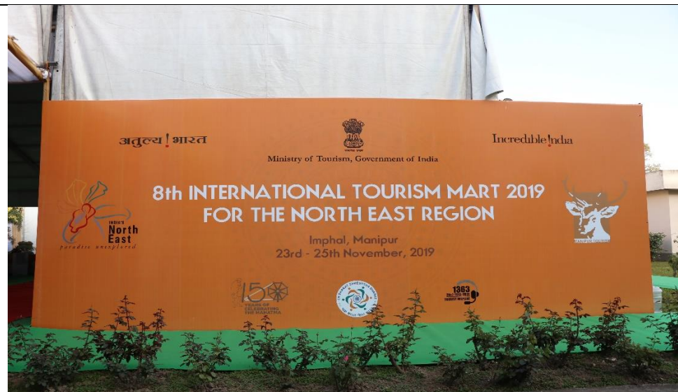
Branding at the dinner venue with EBSB logo of International Tourism Mart 2019 held on 23 rd November, 2019