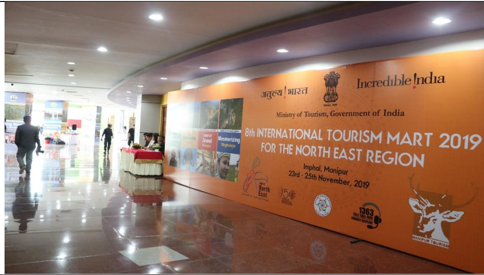
Branding of EBSB at the International Tourism Mart 2019 held at Imphal from 23 rd to 25 th of November, 2019