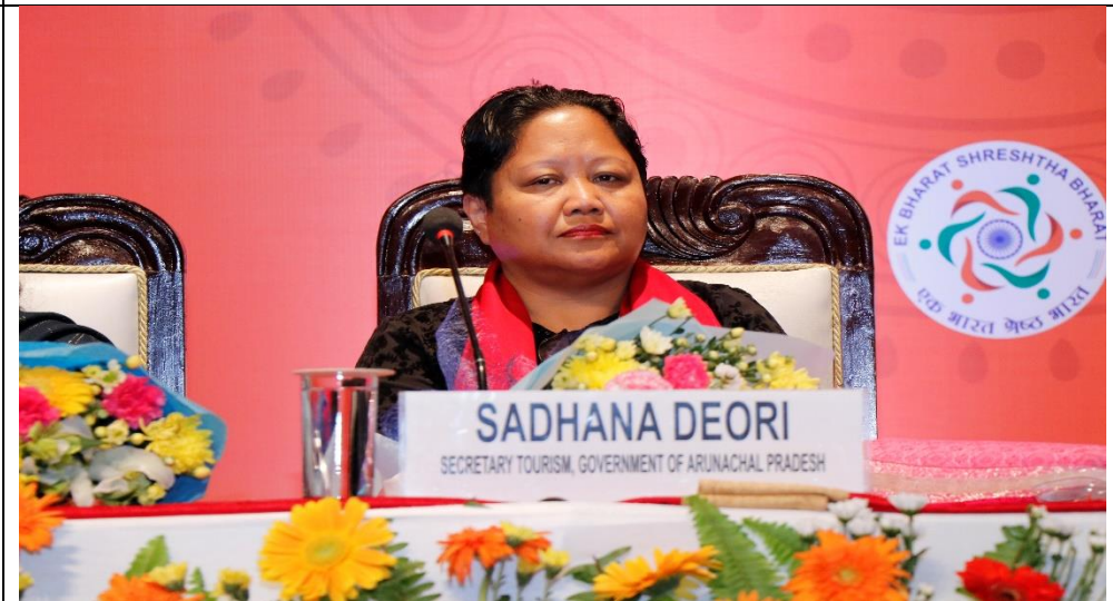
Branding of EBSB at the International Tourism Mart 2019 held at Imphal from 23 rd to 25 th of November, 2019