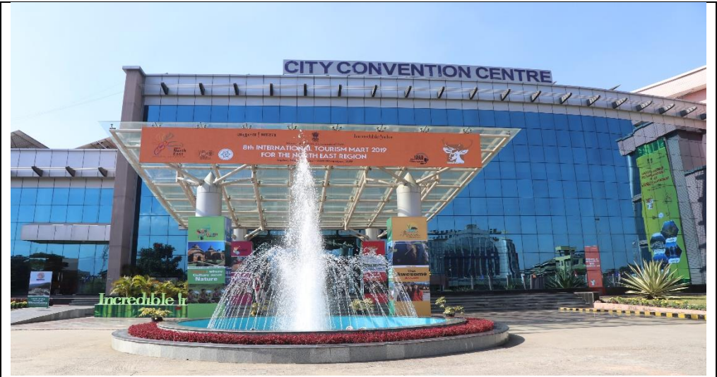
Branding of EBSB at the City Convention Centre venue of International Tourism Mart 2019 held at Imphal from 23 rd to 25 th of November, 2019