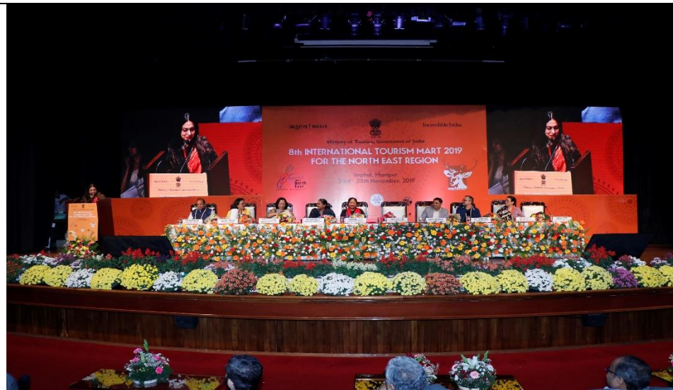
Addl. DG (T) addressing the gathering during the of EBSB at the International Tourism Mart 2019 held at Imphal from 23 rd to 25 th of November, 2019