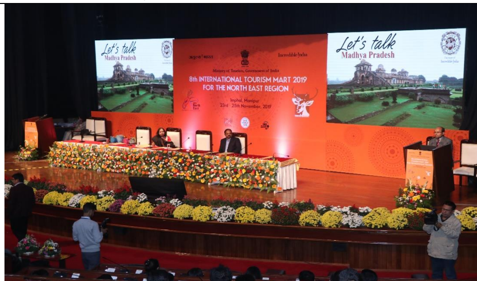
Director (Investment & Tourism) Govt. of Madhya Pradesh addressing the students/youths during ITM 2019 as it is a paired State with Manipur on 24 th November, 2019