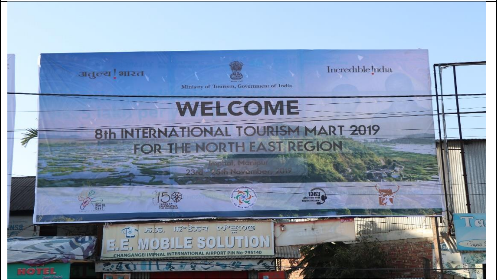
Branding in the city with EBSB logo during International Tourism Mart 2019 held at Imphal from 23 rd to 25 th of November, 2019