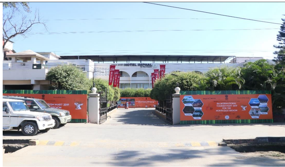
Branding at the dinner venue with EBSB logo of International Tourism Mart 2019 held on 23 rd November, 2019