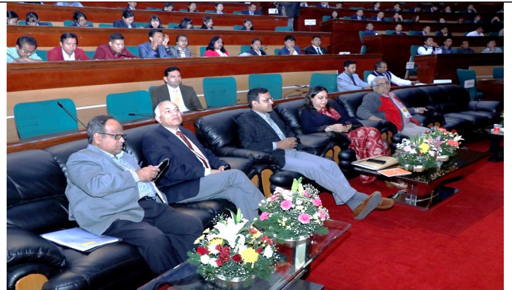
Students / Youths from University and Tourism Institutes attending the presentation by Director (Investment & Tourism) Govt. of Madhya Pradesh during ITM 2019 as it is a paired State with Manipur on 24 th November, 2019