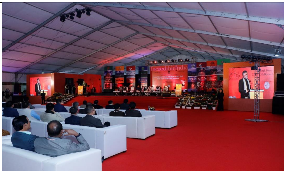
Hon'ble Union Minister Tourism addressing the gathering during the inaugural ceremony of International Tourism Mart 2019 at Imphal on 23-11-2019