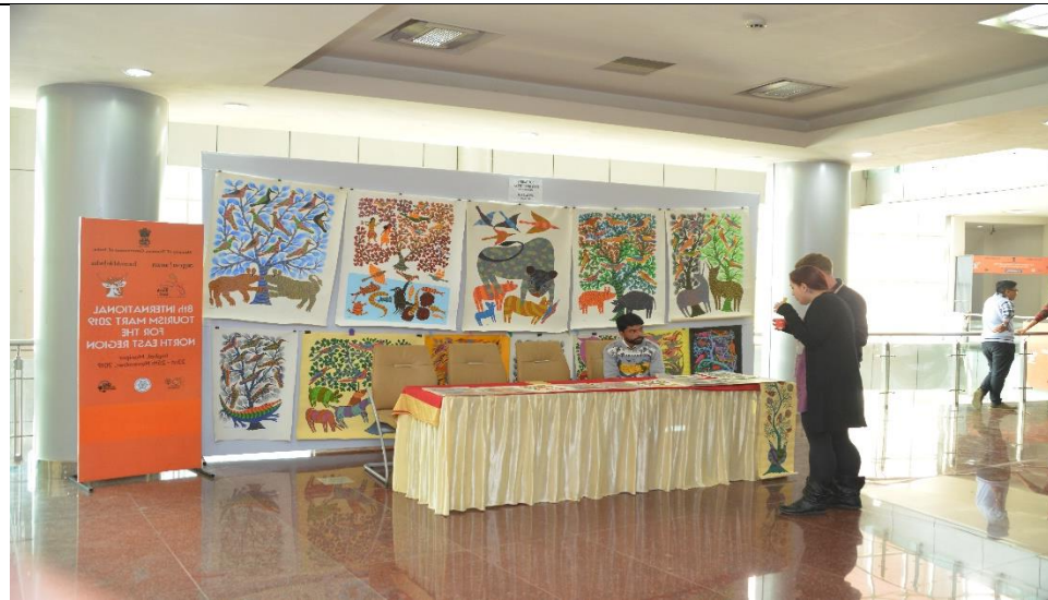
Gond Artist from Madhya Pradesh displaying paintings during ITM 2019 as it is a paired State with Manipur (as per EBSB paired state matrix) on 24 th November, 2019