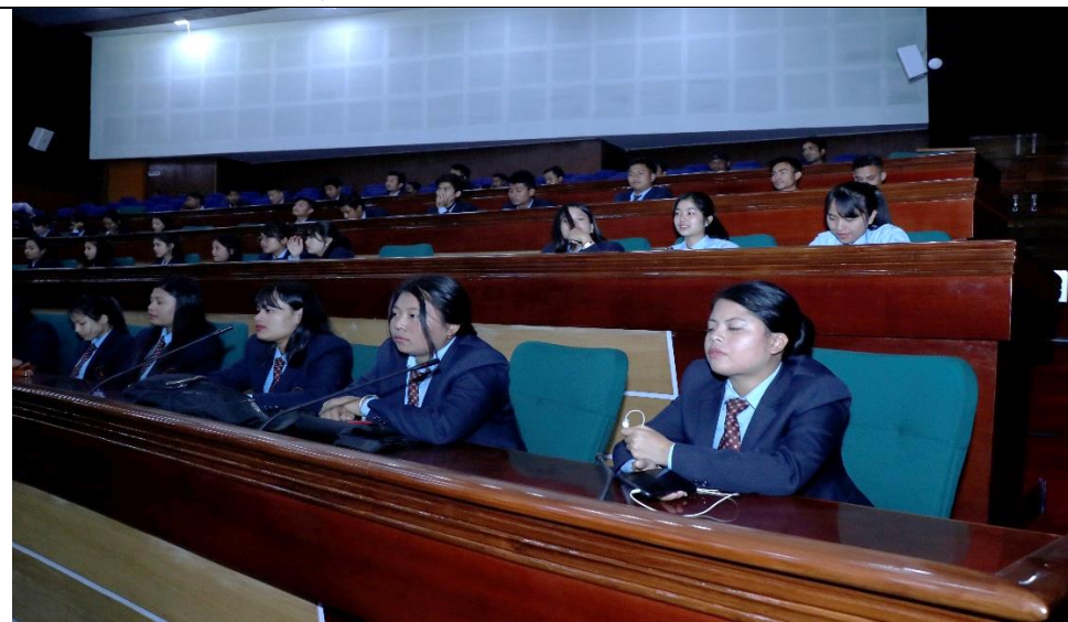
Students / Youths from University and Tourism Institutes attending the presentation by Director (Investment & Tourism) Govt. of Madhya Pradesh during ITM 2019 as it is a paired State with Manipur on 24 th November, 2019