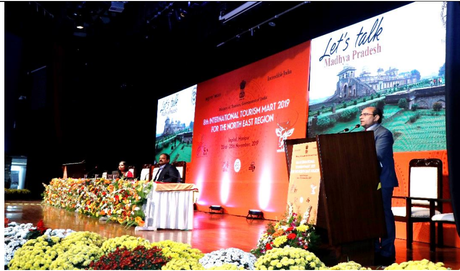
Director (Investment & Tourism) Govt. of Madhya Pradesh addressing the students/youths during ITM 2019 as it is a paired State with Manipur on 24 th November, 2019