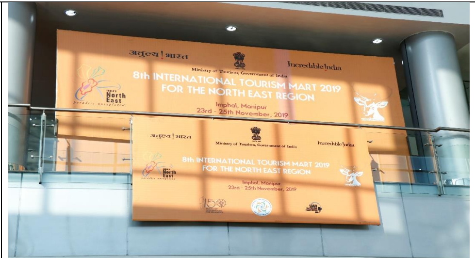
Branding of EBSB at the International Tourism Mart 2019 held at Imphal from 23 rd to 25 th of November, 2019