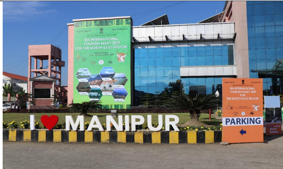
Branding of EBSB at the International Tourism Mart 2019 held at Imphal from 23 rd to 25 th of November, 2019