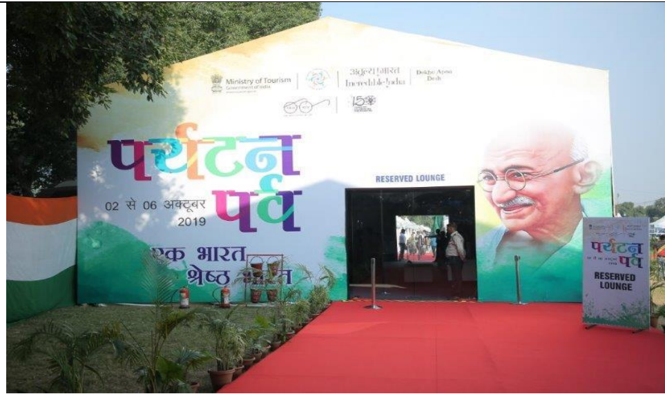
Reserved Lounge Paryatan Parv Rajpath Lawns, New Delhi October 2-6, 2019