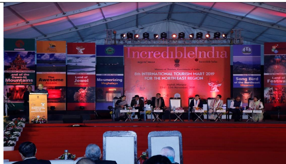
Hon'ble Chief Minister of Manipur addressing the gathering during the inaugural ceremony of International Tourism Mart 2019 at Imphal on 23-11-2019