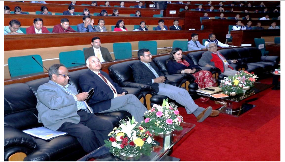
Students / Youths from University and Tourism Institutes attending the presentation by Director (Investment & Tourism) Govt. of Madhya Pradesh during ITM 2019 as it is a paired State with Manipur on 24 th November, 2019