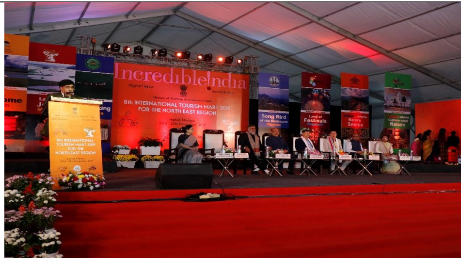
Secretary Tourism Govt. of India addressing the gathering during the inaugural ceremony of International Tourism Mart 2019 at Imphal on 23-11-2019