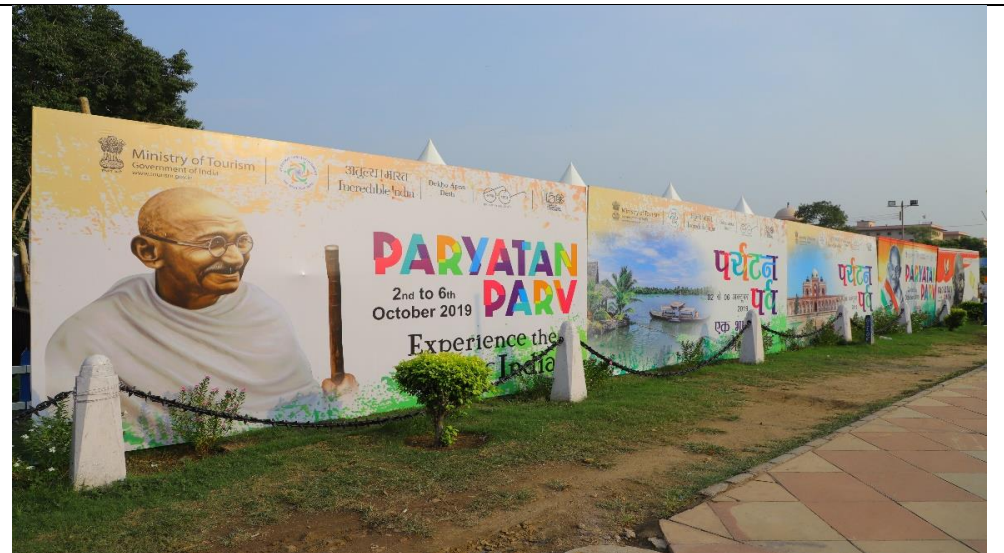
Branding of EBSB at Paryatan Parv Rajpath Lawns, New Delhi October 2-6, 2019