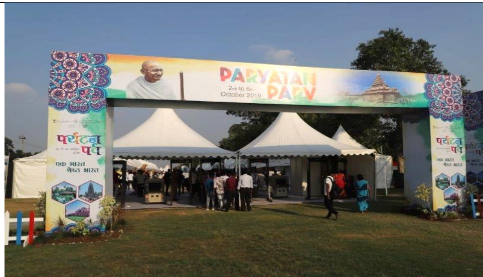
Branding of EBSB at Paryatan Parv Rajpath Lawns, New Delhi October 2-6, 2019